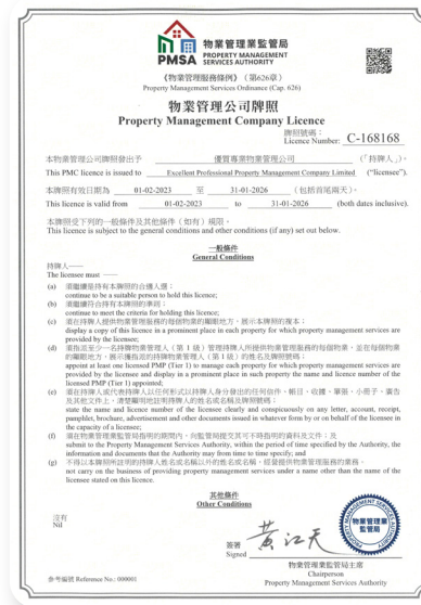
PMC Licence sample

2 Pay attention to whether the property its licence or the "Licensed PMC" sticker issued by the PMSA.