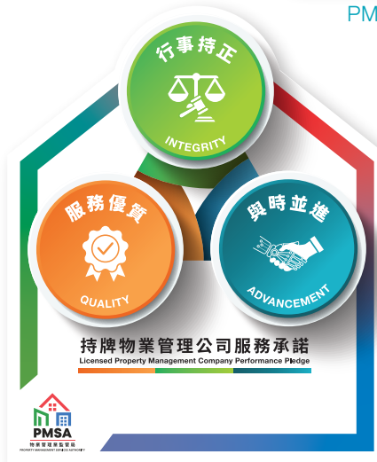
"Licensed PMC" sticker sample

The "Licensed PMC" sticker represents the PMC's commitment to "Quality", "Integrity" and "Advancement" when providing PM services.